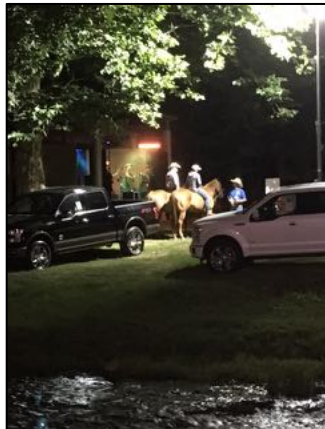
ABOVE: Cowboys and non-cowboys alike enjoy the post-rodeo concert, sponsored by the Minerva Firemen's Association.